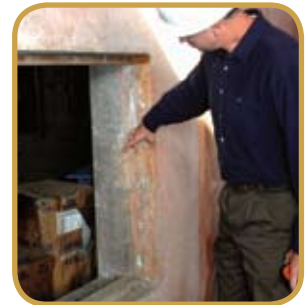
TEMPERATURES IN THE BARREL ROOM AND FERMENTATION AREA will be held constant with very little expenditure of energy by the thick walls of the building and its position deep into the surrounding hill. A blue two-inch layer of foam, sandwiched between concrete slabs, serves as a buffer to the dissipation of inside temperatures and the transference of outside conditions.

Participants in Oregon Pinot Camp will be the first group to visit the facility for a staging of an educational panel on June 26. The new tasting room operation will be finished over the summer and ready to receive visitors in late summer. For now, the existing tasting room remains in full operation and welcomes guests daily 11 to 5.