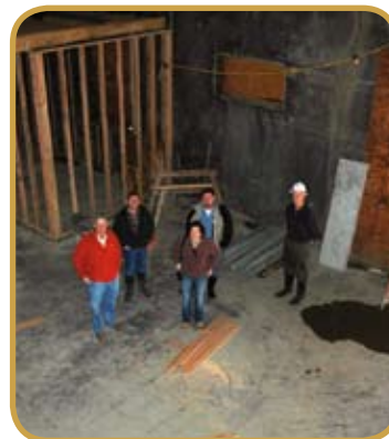
A HIGH CEILING AND LONG VIEWS TO THE WEST distinguish the tasting room. The group here stands where casual seating will accommodate visitors who wish to relax over a glass of wine.