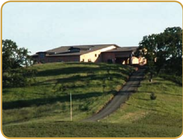
PERCHED NEAR THE TOP OF THE OAK KNOLL on the Van Duzer estate, the new winery is visible as visitors approach from Hwy 22. Winemaking operations were relocated to the new winery facility just after Memorial Day.