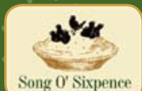
Song O' Sixpence

Gourmet take-out food and eatery enlivens Chicago's North Shore.